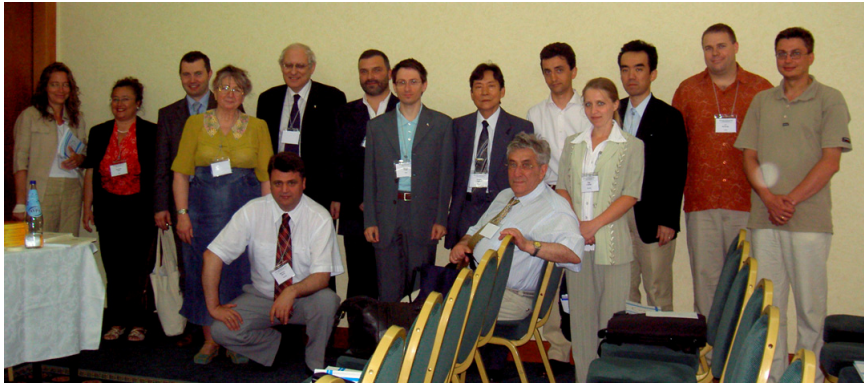
Participants of the Minisymposium Integrity of Dynamical Systems at The 16th European Conference on Fracture 2006