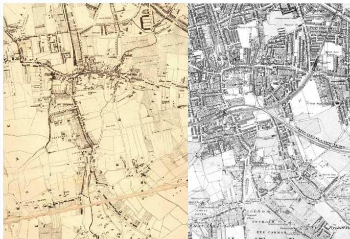
Fig. 3. Peckham 1842 (left), Peckham 1891 (right) [7]

One of the major documents of that research is Sir Edwin Chadwick's report The Sanitary Conditions of the Labouring Population published in 1842. These conditions aimed to improve the quality of life in view of the fact that healthy population would live and work longer.