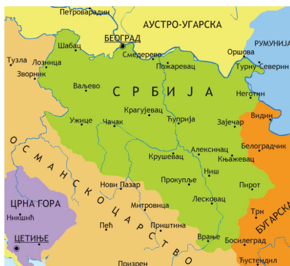
Fig. 1. The Principality of Serbia after the Treaty of Berlin in 1878 [6]

The Principality of Serbia came into existence in 1815 and lasted until 1882 (the year when it was raised to the level of the Kingdom of Serbia). It won full international recognition in 1878 (Fig. 1). The Serbian people resisted the Ottoman oppression during the Serbian revolution. This revolution was national and social revolution of the Serbian people with two armed uprisings taking place (First Serbian Uprising in 1804 and Second Serbian Uprising in 1815). These events marked the foundation of modern Serbia in that Serbia started to keep up with the other European states and accepted their values of civil society. [6]