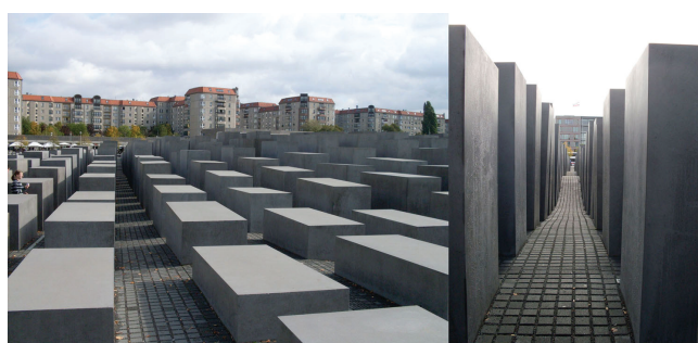
Fig. 5 The Memorial to the murdered Jews of Europe

The Memorial to the murdered Jews of Europe stands in the heart of Berlin, just next to Brandenburg gate in order to send message to all, not only visitors as this is one of the most visited tourist location in the whole Berlin, but also to be visible to the German politicians on their way to Reichstag. This monument, open to public day and night as a place as a remembrance of six million Jewish victims, has been made by the architect Peter Eisenman. The construction work on the Memorial, consisting of the Filed of 2,711 concrete slabs arranged in grid pattern and the underground memorial center, began in 2003 and ended in 2005. The size of the field of concrete slabs is 19.073m 2 with height that vary from 0-4,7m. Each mounted steale has been made from high performance concrete.