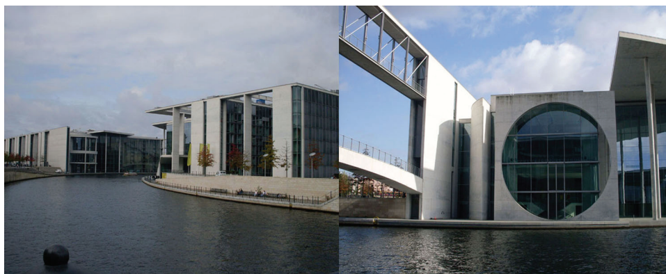
Fig. 3 The two left side buildings are divided by the river Spree. At the left river side is Marie Elisabeth Lüders Haus. At the right side is Paul Löbe Haus