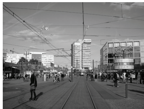
Fig. 9 Alexanderplatz Photographs made by the author 2009