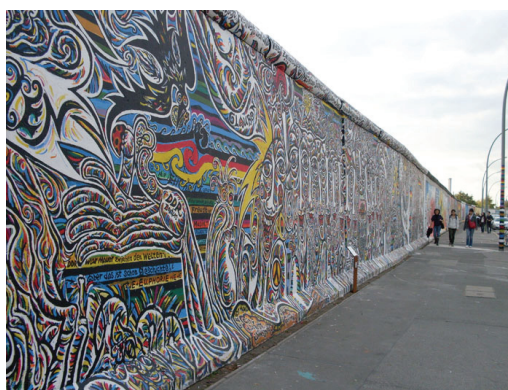
Fig. 7 East Side Gallery

East Berlin became the capital city of the East Germany after Second World War. The typical architecture of socialism is still present in the east part of Berlin. In Figure 7, Figure 8 and Figure 9 the most important parts of East Berlin could be seen. After reunification of Germany, government spent huge investments for reintegration of the two parts of the city. Many changes happened since 1990s. Still, architecture of these two parts, mainly the survival of sky-scrapers from communistic period, made the visual differences between eastern and western part of the town clearly discernible.