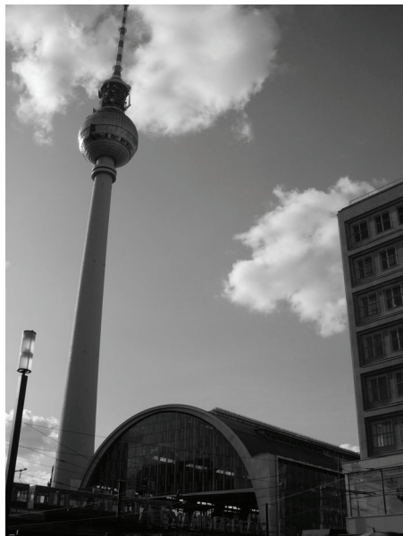
Fig. 8 Fernsehturm Photographs made by the author 2009

The architectural future of East Berlin is in further urban development. The positive urban development is possible only by integrating typical socialistic architecture. These sky-scrapers from the communistic period are a part of the past. The successful future could not be built by destroying the leftovers of the past. There are always ways of reconstruction that could bring progress and modernization.