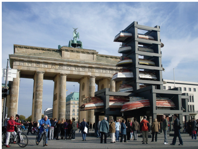
Fig. 10 Installation "At the crossroads" by Greek artist Kalliopi Lemos

Today trend is to make art in open urban space in order to make art more accessible and visible to all citizens. Here is an example how art could assume a role in public space. At Brandenburg gate with installation of Greek artist Kalliopi Lemos. This installation at Brandenburg gate is part of trilogy "Crossing" (Eleusis, Istanbul and Berlin) made by Greek artist Kalliopi Lemos. Each exhibition in this trilogy is consisting of a different installation of wooden Turkish boats which were found abandoned at Greek islands. These three cities are typical route of migration from East to West. Artist raises a question of the feeling of being in between borders, cultures and identities. The last part of trilogy is held in Berlin in period of 13 th -30 th October 2009. By putting this installation in front of the Brandenburg gate, boundaries and limits of art in open spaces are moved forward. Berlin is the best place to make such avant-garde story with a strong message. The time has come when public space also participate in the evolution of art.