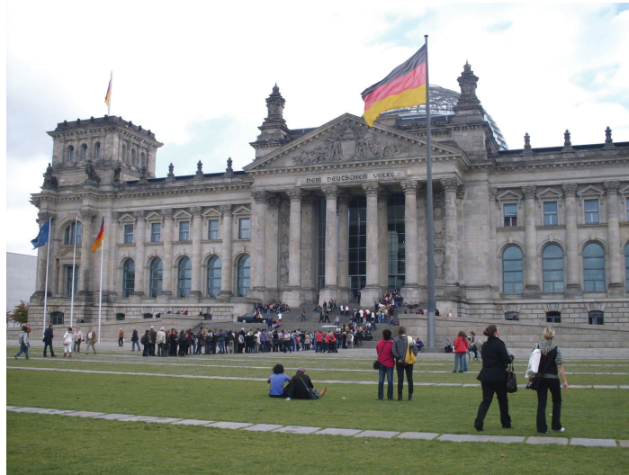
Fig. 2 Reichstag, German Parliament; Photograph made by the author 2009

The original building of the Reichstag, German Parliament, was built in the style of the Italian Renaissance in 1894 by architect Paul Wallot. The Reichstag building suffered huge damage in bombing during World War II. Renovation of the building which was carried out according to plans by Paul Baumgarten, started in 1954 and was finally completed in 1972. After German reunification, Sir Norman Foster was commissioned to carry out the design for new Reichstag. The major change was removing mezzanine floors and adding a new glass dome to the room. Adding the new glass dome was very successful as the dome became one of the main tourist attraction of the city. Glass panels in the dome allows visitors to look at down into the parliamentary chamber beneath.