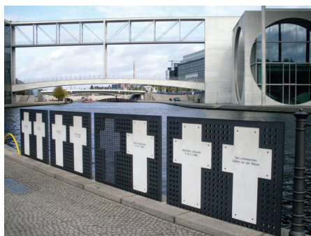
Fig. 4 Detail of memorial could be seen in front of the Bundestag complex. This is one of the numerous examples how the German government pays respect to the victims of the past; Photographs made by the author 2009