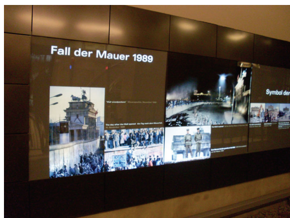
Fig. 1 Wall Memory in metro station at Brandenburg gate; the newest underground station has three lines that going from Hauptbahnhof to Brandenburg gate (Berlin main train station officially opened in 2006 after almost eight years of construction work)