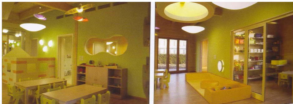
Fig. 4. Kindergarten "Nido Stelia" Modena (Italia), 2004