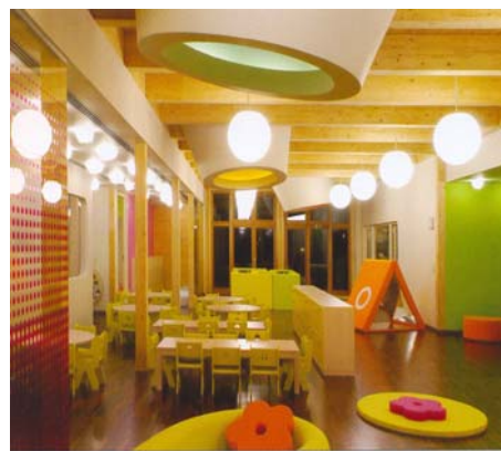
Fig. 2. Kindergarten "Nido Stelia" Modena (Italia), 2004