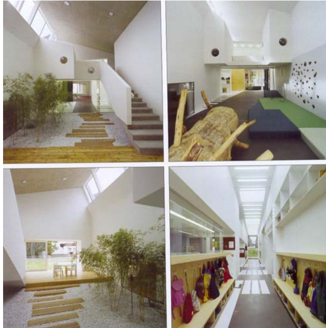
Fig. 3. Kindergarten in Oegstgeest (Nederland), Herman Hertzberger, 2000

The constructing of the components of the environment which enable a child to get its needs for achieving skills and new challenges met, include a certain group of features, which the space should have.