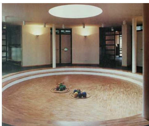
Fig. 1. Kindergarten "Birkenam" Odenwald (German), 1993

Thus, if some space is constructed and equipped in the right way, the development of a child's increased abilities gets supported, and that allows a child to confirm itself at the existing level of its capacities.